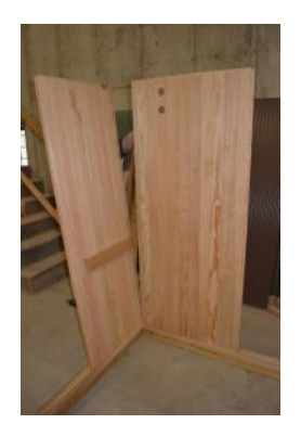
Position Wall Sections A & B

The 9 wall sections, A– I, will be positioned in the grooves of the completed wall support section as shown.