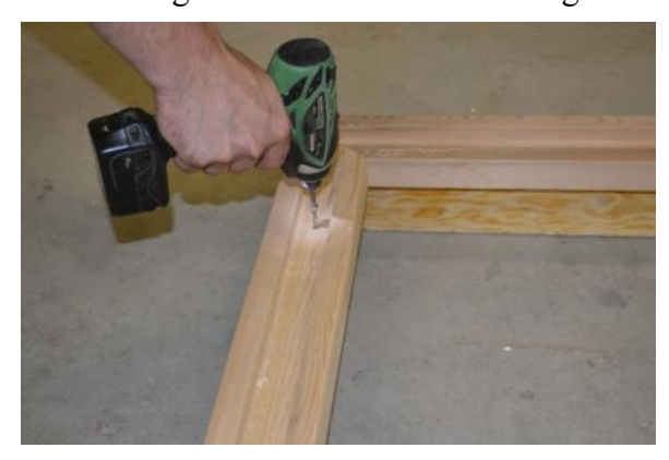
Fasten wall support rails to floor riser