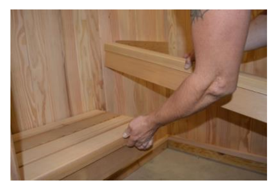
Attach Foot Rest and Lower Side Bench

NOTE: After attaching the bench to the two bench supports, look under the bench and also screw the bench to the back wall through the predrilled holes and with 2" screws.