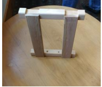
2 Prop up the pre-assembled portion and attach t