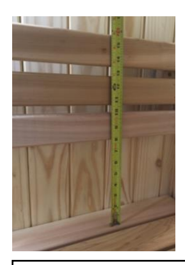
18. Measure Height for LONG BACK REST

Measure the desired position at which you will later install the Long Back Rest above the Top Bench. (Suggested: 8-12" above the bench and centered on the wall.)