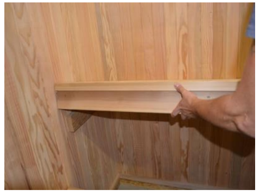
Attach Upper Bench