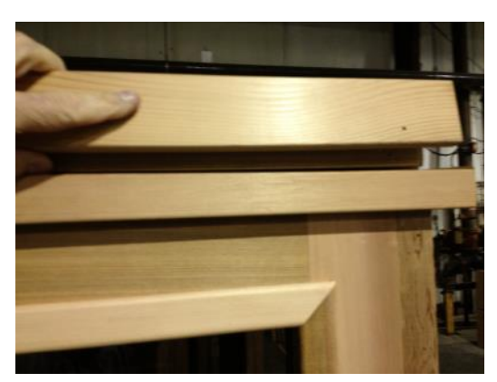
Attach Roof Trim pieces