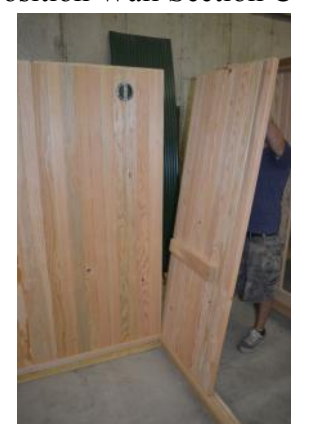
Position Wall Section D