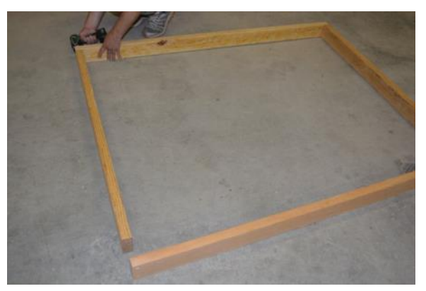
Assemble floor riser