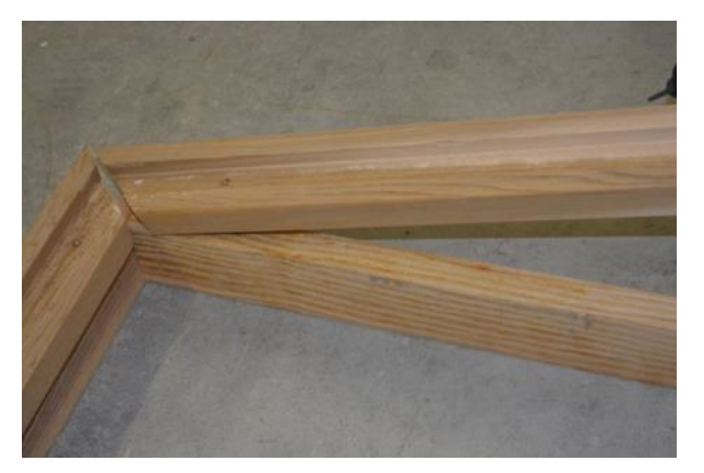
Position wall support rails