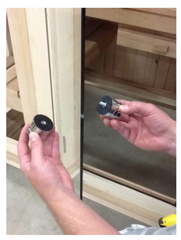
Attach Door Knob on Door