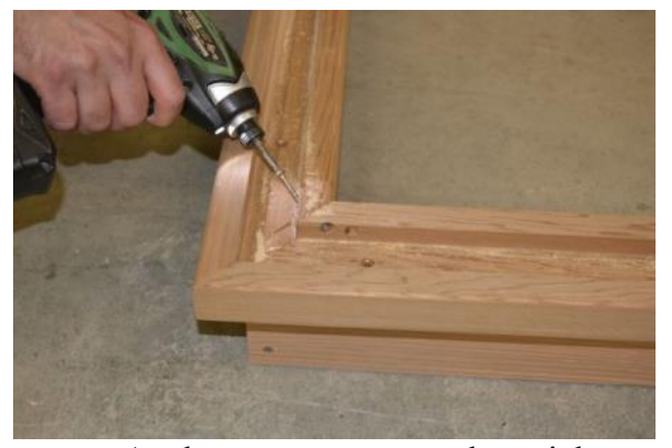
Angle-screw corners to draw tight