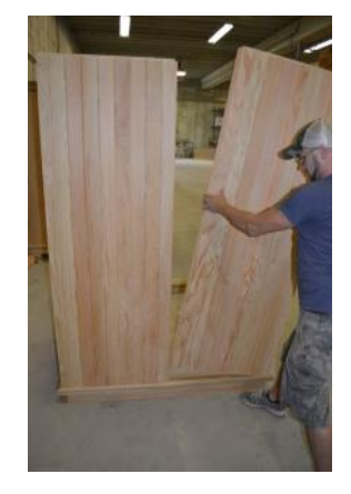
Position Wall Section I