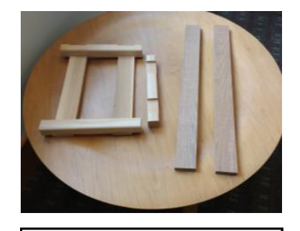
1. Your fence kit will arrive banded with stretch wrap. It consists of four pieces, shown here.

8.0kw 8-2 w/ground, copper wire only, and 40amp non-GFCI breaker.