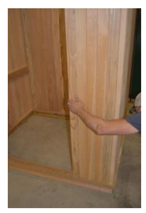
Position Wall Section F