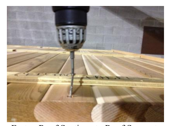
Fasten Roof Sections to Roof Support