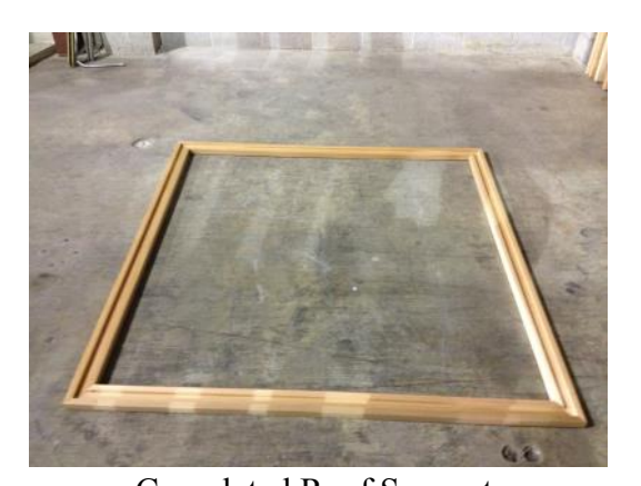
Completed Roof Support

Connect Wall Sections H and F to Door Section G by angle-screwing the wall sections with 2" screws.