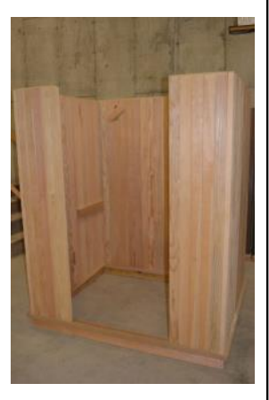
Position Wall Section H