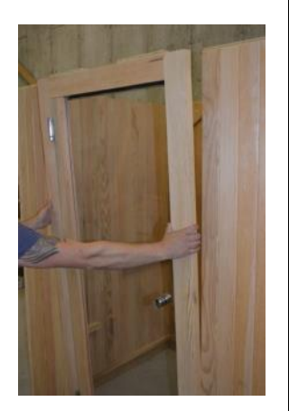
Position Door Section G

NOTE: As with step 6, be sure the wall edges and top edges align evenly.