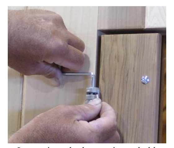
Insert pin and relax tension to hold