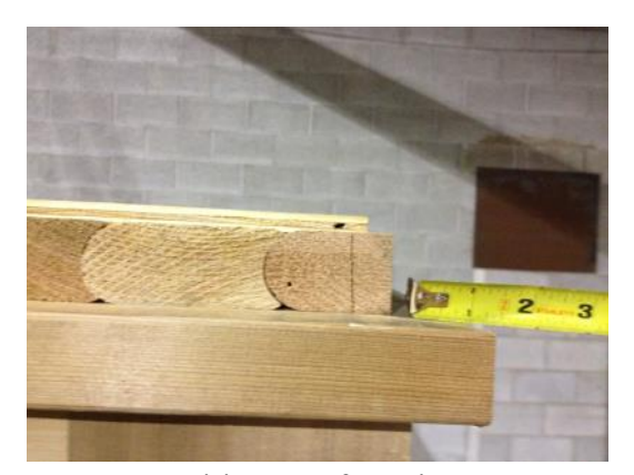
Position Roof Sections