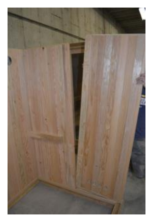
Position Wall Section E