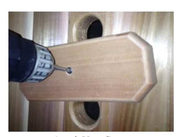
Attach Vent Cover