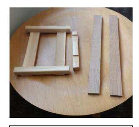
22. Your fence kit will arrive banded with stretch wrap. It consists of four pieces, shown here.