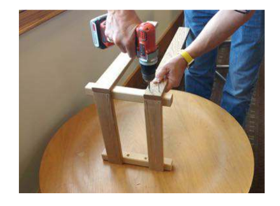
23. Prop up the pre-assembled portion and attach the two long horizontal pieces. Make sure the countersunk holes on the wall mounting bracket face inward.